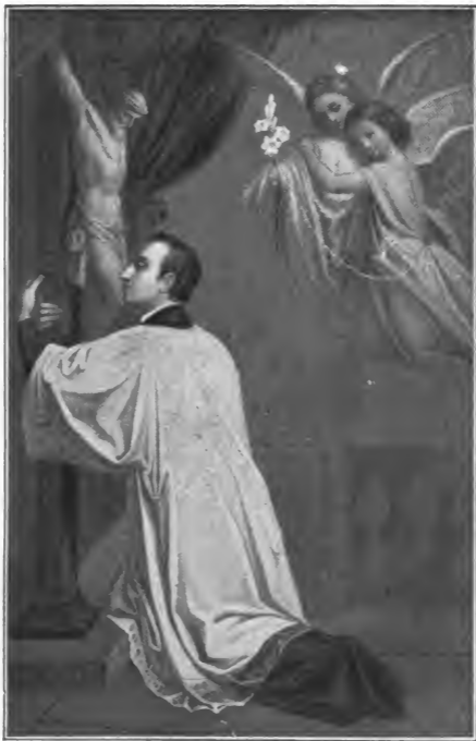
St. Aloysius, our model and patron, pray for us that we may lead a pure and holy life.